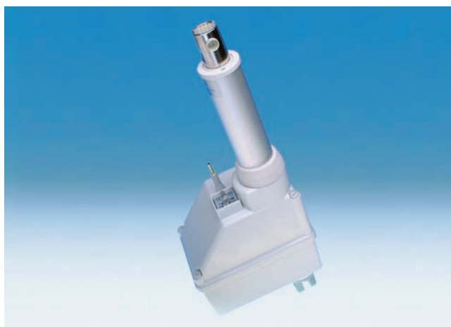
Possible tilting drive SL 95

Various tilting drives are available to meet our customers' requirements.